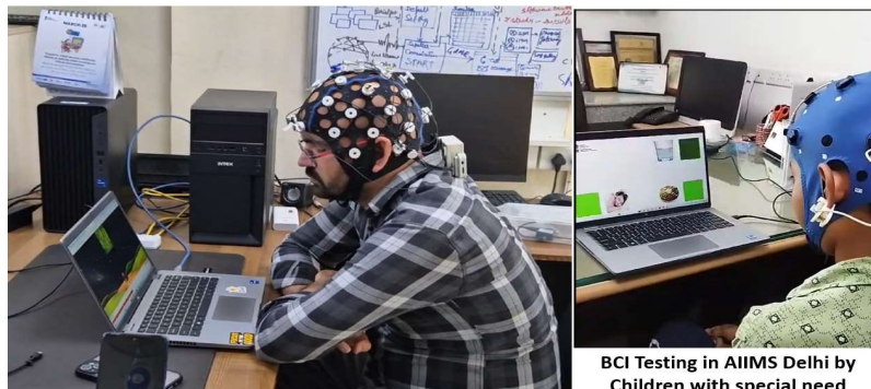
Vivan-BCI is designed to interface with a customized, interactive, and user-friendly mobile/web browser. This interface serves as direct aid for patients, supporting them in their day-to-day activities.