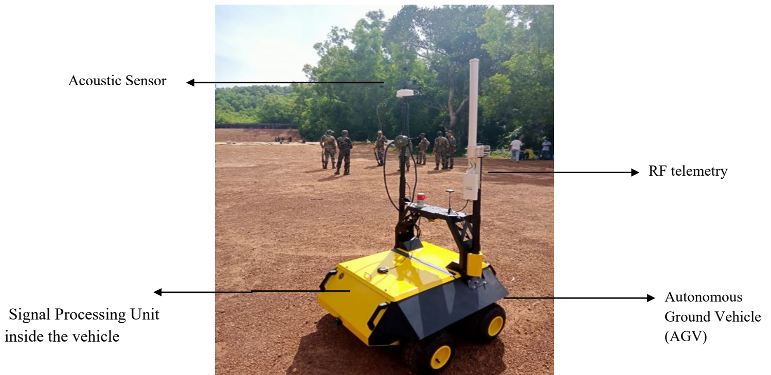
Fig. 2. Vehicle mount system mounted in AGV