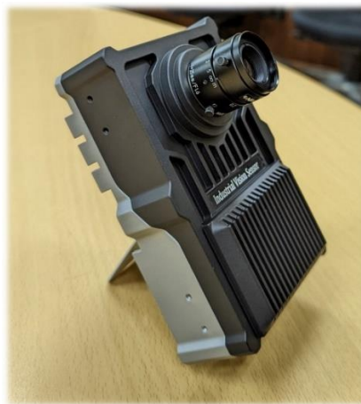
Fig. 2. iViS-10GigE product image

Internally the iViS hardware is comprised of a 3-layer stack arrangement, where the user can easily upgrade the system to higher resolution sensors, with minimal time and effort. The system would allow to create a network of cameras using the GigE vision protocol and a collective vision logic can be performed at a host PC, based on the application requirements. The developed product snapshot is shown in Fig.2: