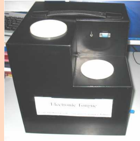
Photographs of E-Tongue System developed by C-DAC, Kolkata