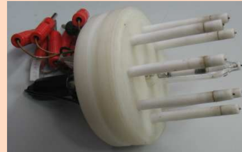
Photographs of E-Tongue Sensor developed by C-DAC, Kolkata