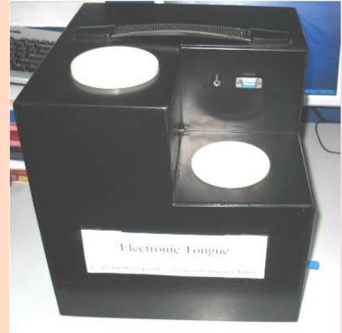
Photographs of E-Tongue System developed by C-DAC, Kolkata