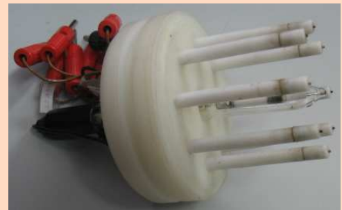
Photographs of E-Tongue Sensor developed by C-DAC, Kolkata